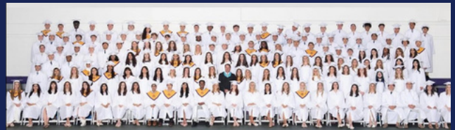
The Kinkaid School Class of 2026